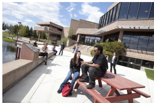
Lakehead University, Thunder Bay campus